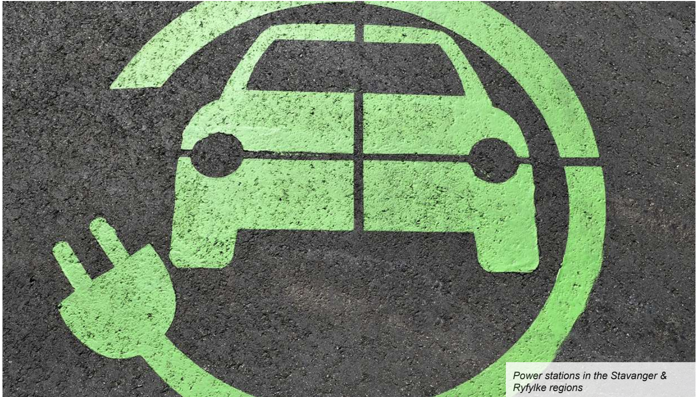
Power stations in the Stavanger & Ryfylke regions

STAVANGER & RYFYLKE REGIONS 4000 *STAVANGER